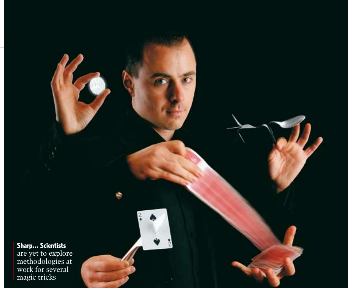
Sharp... Scientists are yet to explore methodologies at work for several magic tricks