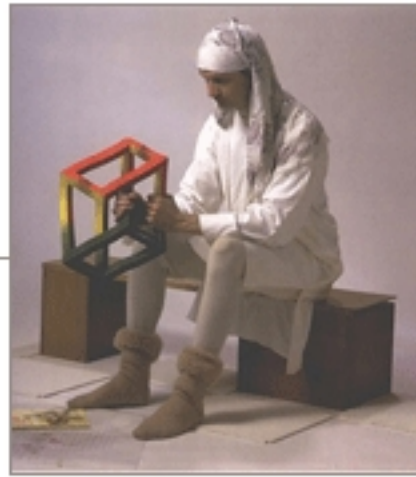
GALLERY "Sculpting the Impossible"

Most of the visual illusions we see are two-dimensional. But Scientific American's "Sculpting the Impossible" slide show brings out-of-the-question objects to real, three-dimensional life.